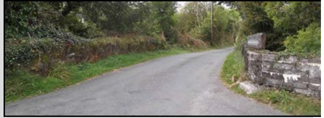
Road deck & parapets