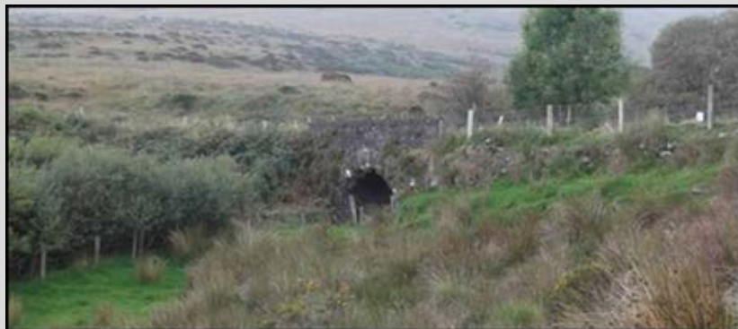
View from east

Single segmental-arched bridge of stone construction over Garrane River; late 19 th /early 20 th century; stone parapets with concrete coping; flat road deck. Ground built up on either sides of valley to accommodate road.