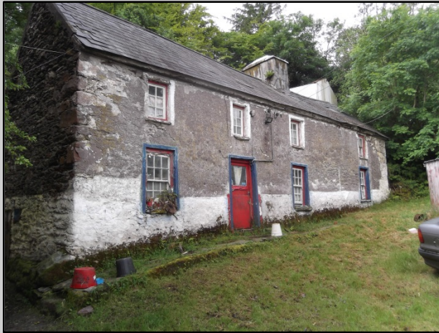
(b) Single-storey detached gable-ended outbuilding incorporating single central doorway in west-facing façade; largely covered with white-washed render and incorporating a slated ridged roof.